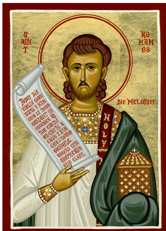
Tone 4 (Greek Chant)